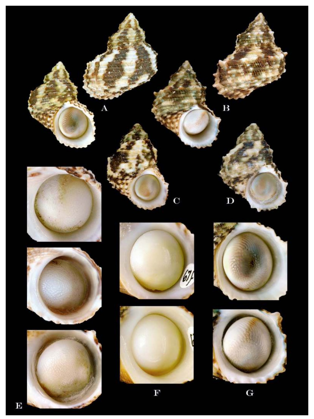
Fig. 4. A-D. Turbo tuberculosus Quoy & Gaimard, 1834. A. New Caledonia, 30 mm (height). B. New Caledonia, 29 mm. C. Solomon Islands, 33 mm. D. Solomon Islands, 30 mm. All coll. Alf. E-G. Opercula. E. Turbo lorenzi spec. nov. F. Turbo radiatus . G. Turbo tuberculosus .