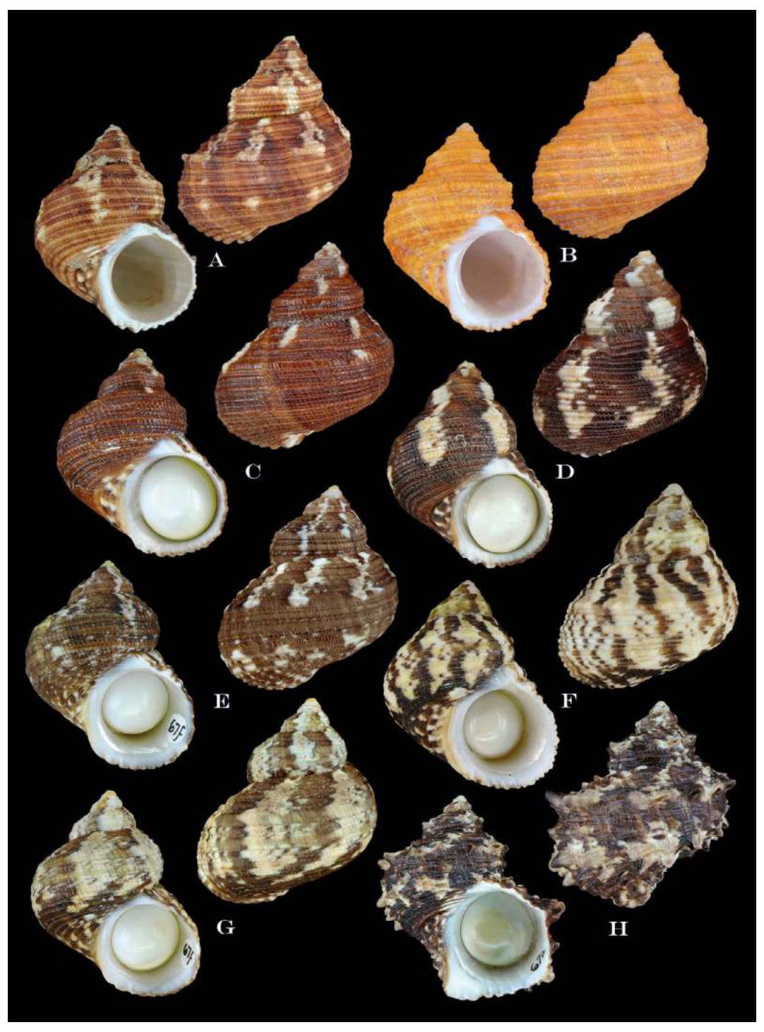
Fig. 1. Turbo radiatus Gmelin, 1791. A. Madagascar, 46 mm (height), coll. Kreipl. B. Madagascar, 32 mm, coll. Kreipl. C. Comoros, 30 mm, coll. Kreipl. D. Comoros, 34 mm, coll. Kreipl. E. Kenya, 38 mm, coll. Alf. F. Comoros, 45 mm, coll. Kreipl. G. Kenya, 39 mm, coll. Alf. H. Oman, 51 mm, coll. Alf.