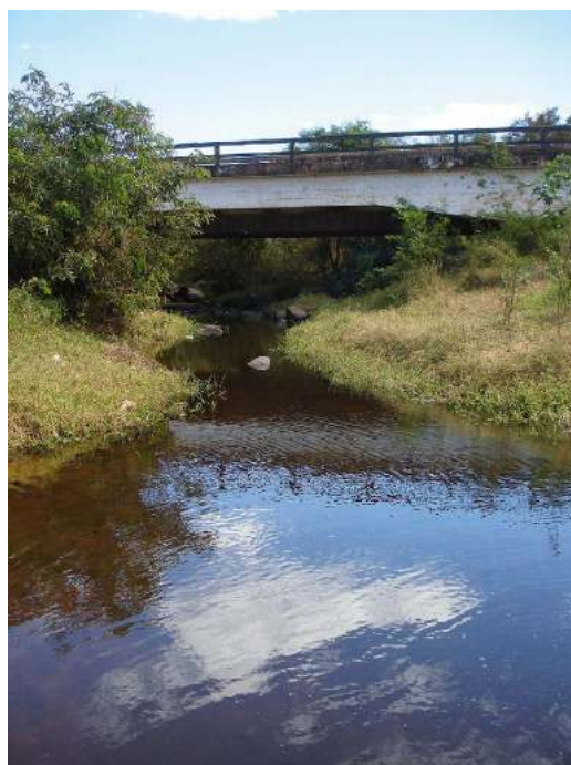
Fig. 7. Type locality of Serrapinnus zanatae ; rio Bananal, tributary of rio Salinas in a dam nearby Salinas, rio Jequitinhonha basin.