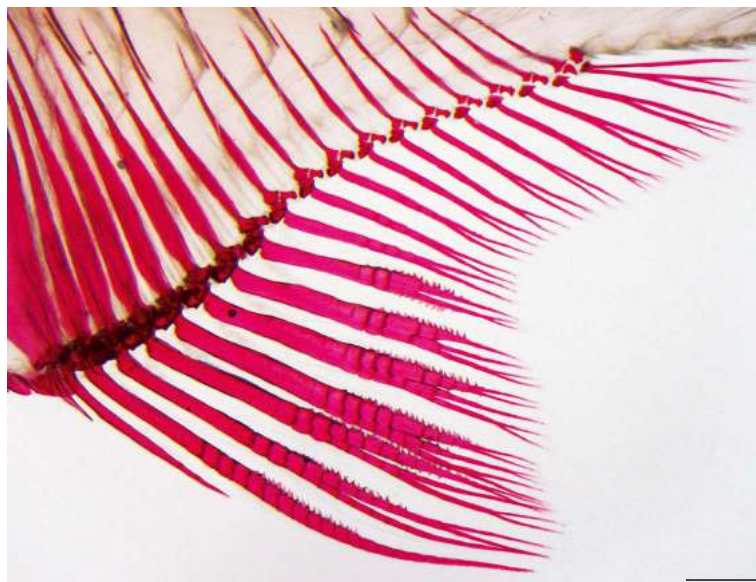
Fig. 3. Serrapinnus zanatae ; MZUSP 5133, paratype male, 36.8 mm SL; anal fin of a mature male with hypertrophied anal-fin rays and hooks shape and arrangement. Lateral view, anterior to left. Scale bar 1 mm.