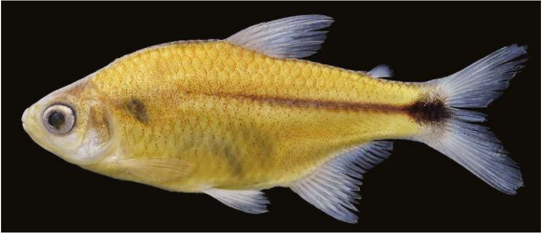
Fig. 1. Serrapinnus zanatae , MZUSP 116000, holotype, male, 36.8 mm SL; Brazil: Minas Gerais State: rio Jequitinhonha basin.

soft tissue associated to hook-bearing anal-fin rays. Pectoral-fin rays i^*(38) , 10(14), 11^*(20) or 12(4). Unbranched pectoral-fin ray falling short of pelvic-fin origin. Pelvic-fin origin anterior to vertical through dorsal-fin origin. Pelvic-fin rays i,7^*(38) . Branched pelvic-fin rays with acute hooks in males, 1 pair per segment of lepidotrichia, ven-