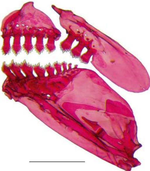
Fig. 2. Serrapinnus zanatae ; MZUSP 5133, paratype male, 36.8 mm SL; clear and stained jaws showing left side of premaxilla, maxilla and dentary. Lateral view, anterior to left. Scale bar 1 mm.

Color in alcohol. Overall body coloration white to dusky, old preserved specimens yellowish (Fig. 1). Head darker over dorsal region of neurocranium, moderately dark anteriorly and usually darker on posterior half. Snout and maxilla darker due to higher concentration of dark chromatophores. Dark brown chromatophores scattered