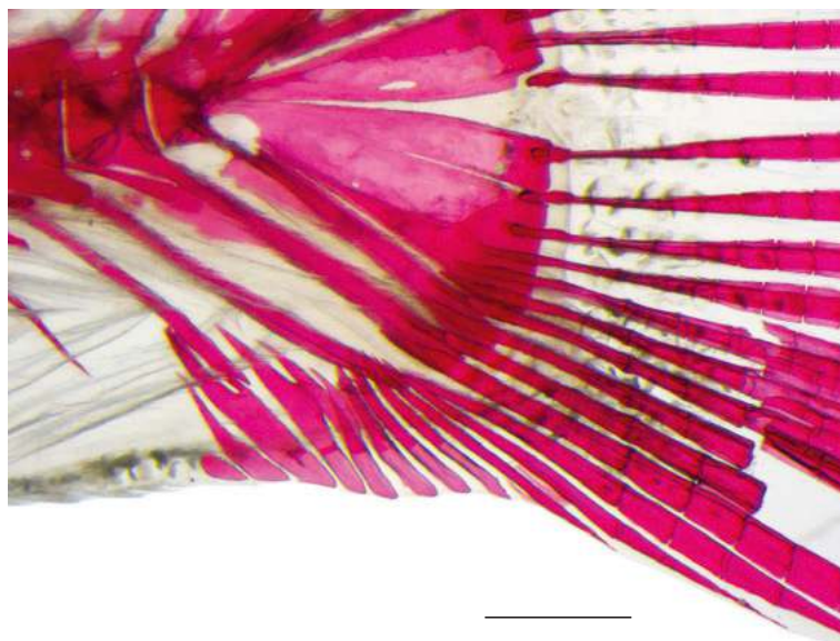
Fig. 4. Serrapinnus zanatae ; MZUSP 5133, paratype male, 36.8 mm SL; ventral procurrent caudal-fin rays. Lateral view, anterior to left. Scale bar 1 mm.

over maxillary bone, infraorbitals and opercular apparatus. Opercular apparatus, infraorbitals 3–6 and branchiostegal rays silver in some individuals due to concentration of guanine. Ventral region of head pale or with a few scattered dark