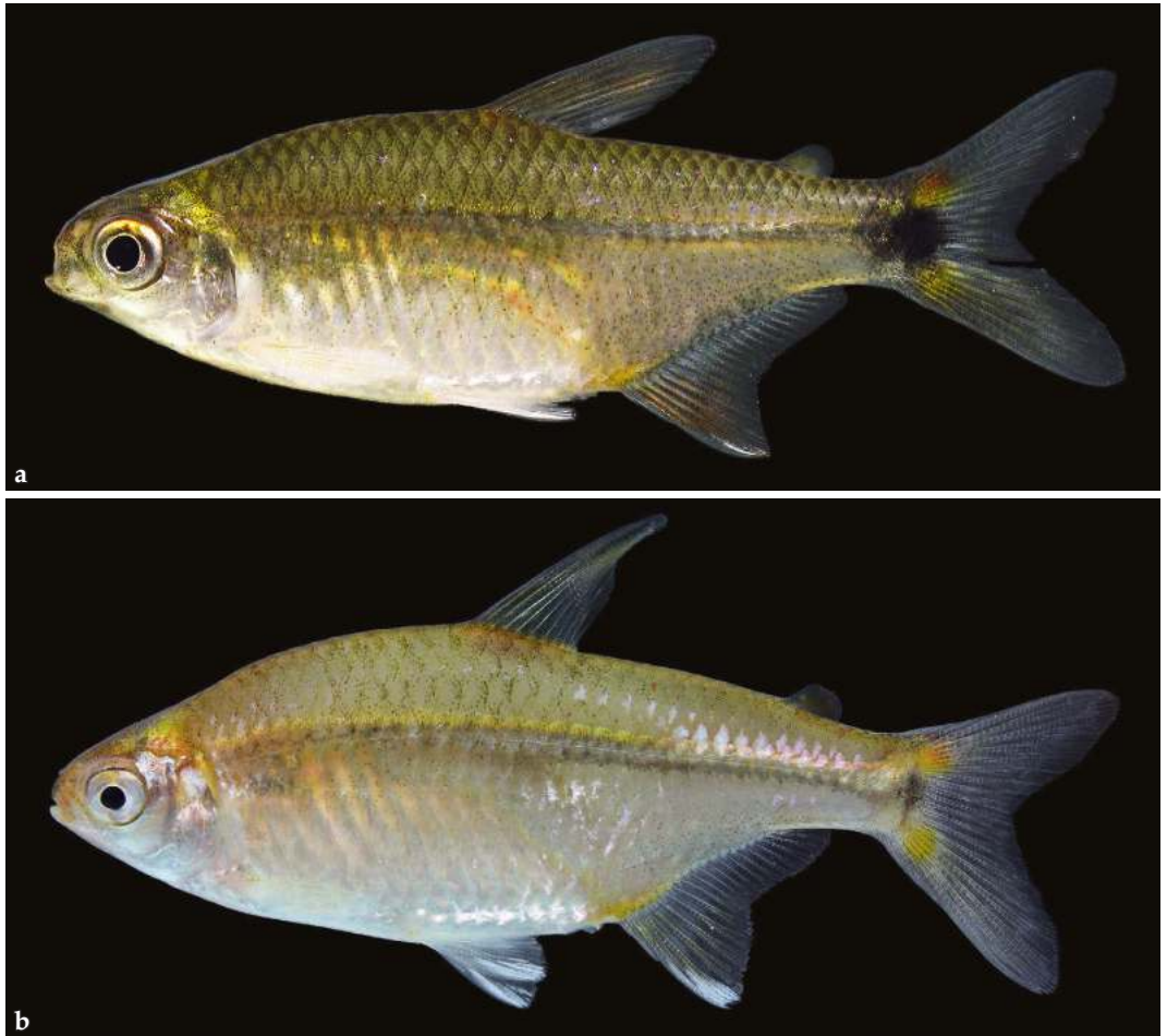
Fig. 5. Coloration in life of Serrapinnus zanatae ; Brazil: Minas Gerais State: rio Jequitinhonha basin; a , UFBA 6967, 32.6 mm SL, paratype male; and b , MCNIP 1597, 39.4 mm SL, paratype male.

equal in size and length forming a straight line in A. melanogramma vs. dentary teeth with central cusp longer and remaining cusps smaller similar to those of premaxillary teeth in S. zanatae ).