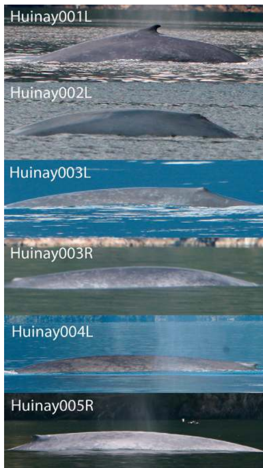
Fig. 3. Individual blue whales photographed in Comau Fjord. Blue whales are distinguished by the unique pattern of mottling on both sides of the body near the dorsal fin.

◁ Fig. 2. Blue whales sighted in the Comau Fjord. A. The head of the blue whale is flat, U-shaped and has a prominent ridge running from the blowhole to the top of the upper lip. The typical straight blow can reach more than 10 m height. B. Aerial view of blue whales in Comau Fjord. C. The small dorsal fin which is located around three-quarters of the way along the length of the body is visible only briefly during the dive sequence. D. The whales approach the shores of the Comau Fjord as close as 100 m. E. The tail fluke is only raised during deeper dives.