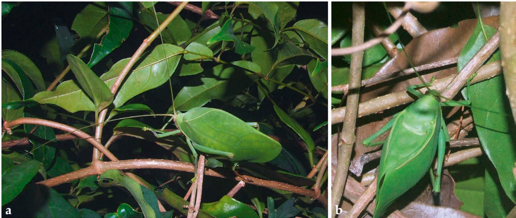
Fig. 2. Two individuals of Paracycloptera grandifolia found at night in a shrub just in front of a research station in Serra da Jibóia. a. Lateral view and b. dorsal view.

bands could be discerned. However, these structures only became evident in recordings made nearer the individuals. This was only possible in Serra da Jibóia and Santa Terezinha. At the other locations the individuals only called at the canopy and this interfered negatively in the quality of the recordings.