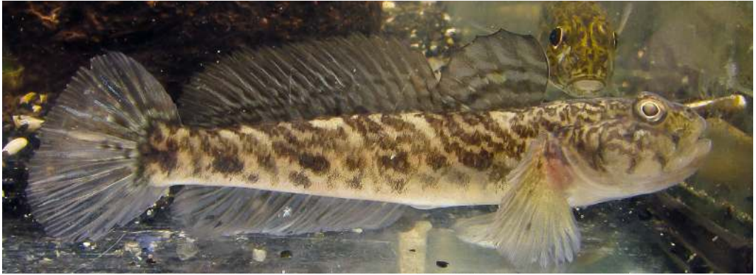
Fig. 2. Babka gymnotrachelus (ZSM 41739), photographed shortly after collection.