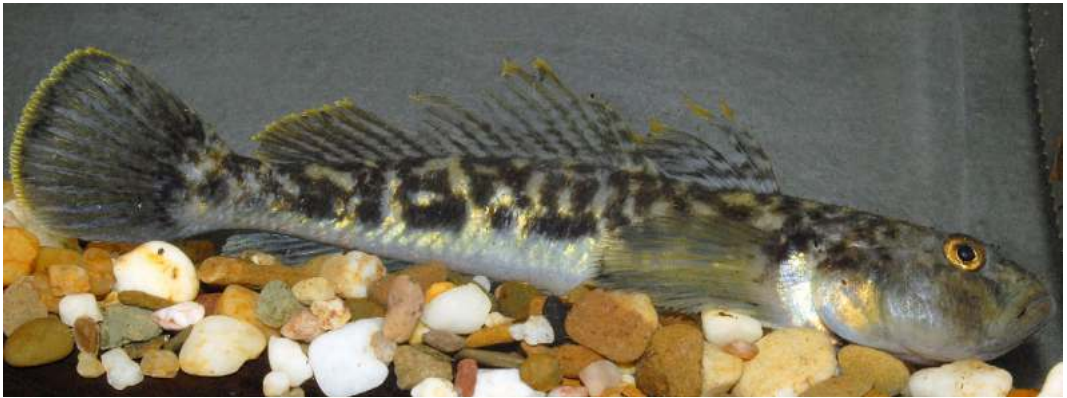
Fig. 3. Neogobius fluviatilis (ZSM 41740), photographed shortly after collection.