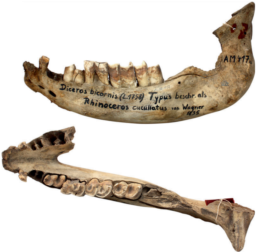
Fig. 8. The only remains of the type of Rhinoceros cucullatus , being part of the lower jaw removed from the mounted specimen some time before 1944.

scientific and popular books, while the evidence on the double-horned rhinoceros was not yet generally available. When Bruce heard about the existence of a rhinoceros in Ethiopia during his travels in 1770, he would naturally have expected to see an animal which looked like Rhinoceros unicornis . This led him astray in his recollections. It is quite likely that he did not actually take much pains to examine the rhinoceros which was killed by his party, beyond noticing the fact that there were two horns on the head. He did not make any sketches, and the animal might have been quickly cut up by the hunters. When he came to write up his adventures, at least ten years later,