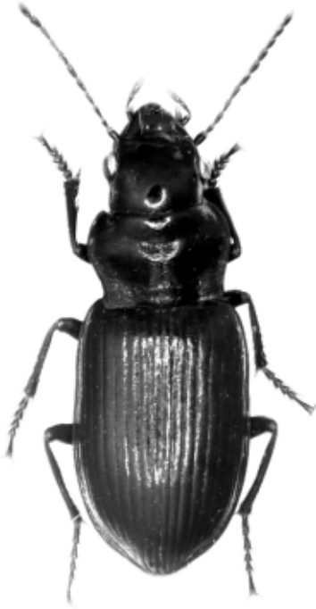
Fig. 1. Chydaeus darlingtoni , spec. nov. Habitus. Length: 9.8 mm.

taken by other authors. Length of pronotum was measured along midline, width of apex of pronotum at the most projecting part of the apical angles, width of base of pronotum at the extreme tips of the basal angles.