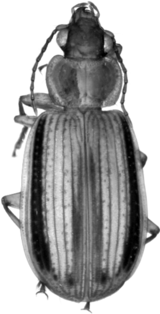
Fig. 1. Amblytelus fallax , spec. nov., holotype. Habitus and colour pattern. Length: 9.5 mm.

dark lateral stripes of elytra piceous to almost black, the sutural stripe reddish. Suture of elytra including 2 nd interval dark, dark lateral stripes occupying the lateral two thirds of 6 th interval and the whole 7 th interval, margin light from 8 th interval onwards. Sutural stripe not reaching base, gradually fading towards base. The light discal stripes ending at a short distance from apex, apex of elytra completely reddish, because the black lateral stripes are also abbreviated near apex and are fading into reddish.